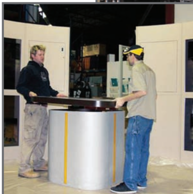
Exhibit Management & Logistics:

Over 20 years experience getting you there on time and show ready!